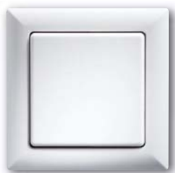
Wireless pushbutton with rocker