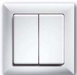
Wireless pushbutton with double rocker