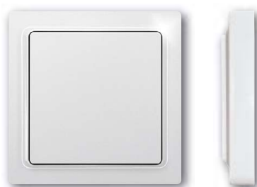
Pushbutton with rocker